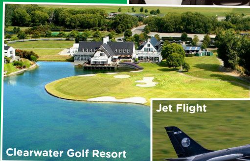
Clearwater Golf Resort