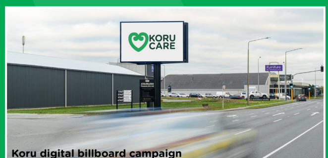
Koru digital billboard campaign

We appreciate the support of Canterbury locals to make this magic happen for the kids.